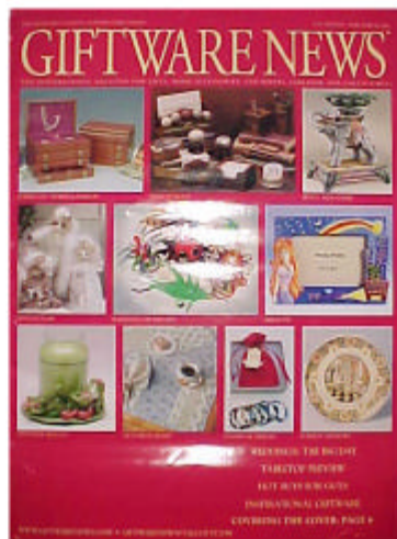
As shown in Giftware News, March 2003.